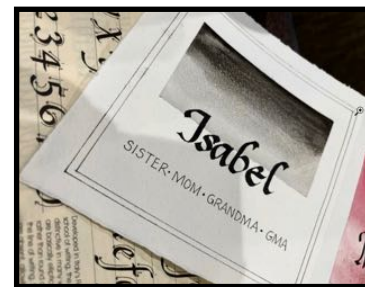
Name plates by Matilda, working with water colors on wet paper.