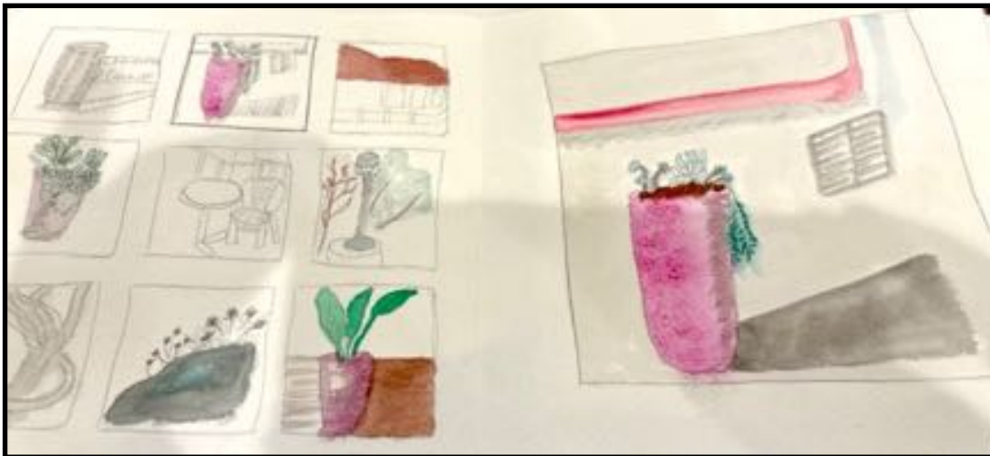
Thumbnails by Matilda Maestas.